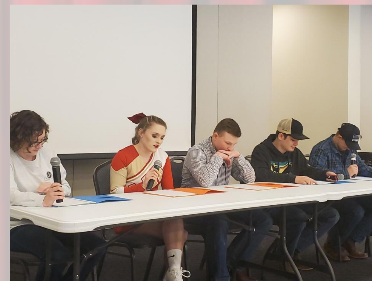
Picture 2: Lee FFA members presenting their original play at the Women in Agriculture Conference in Lebanon, VA.